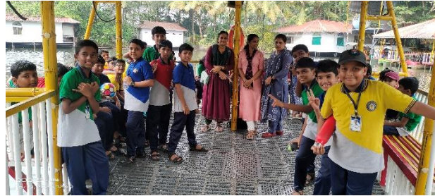
Middle school students explored Munnar