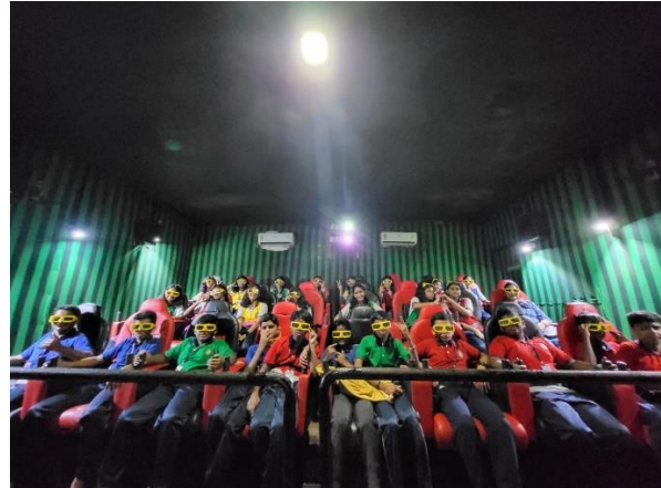
Senior students enjoyed an enriching trip to Coorg